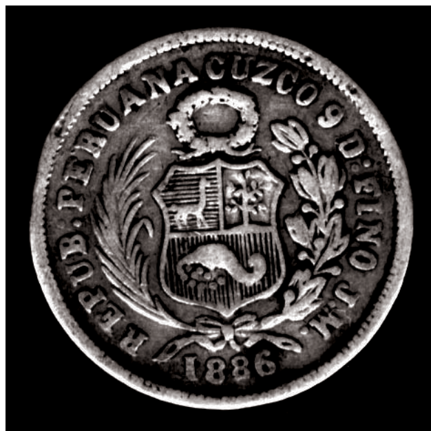
1886 - UN DINERO - CUZCO - REV