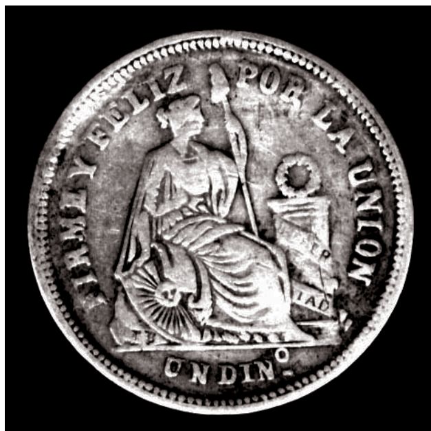
1886 - UN DINERO - CUZCO - OBV