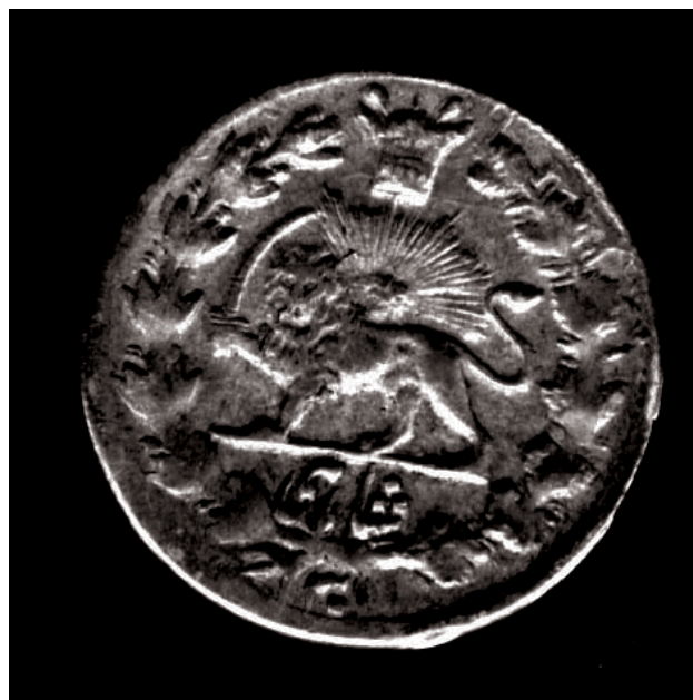
1883 - AH 1301 - 3 SHAHI - REV