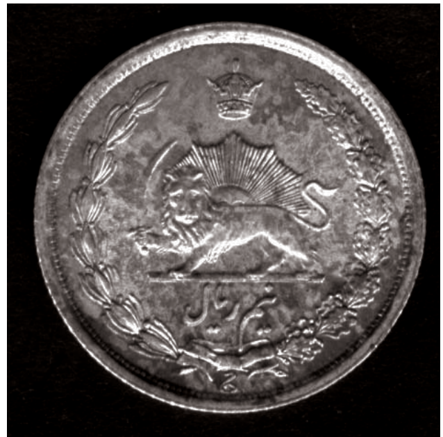
1935 - SH 1314 - 1/2 RIAL - REV