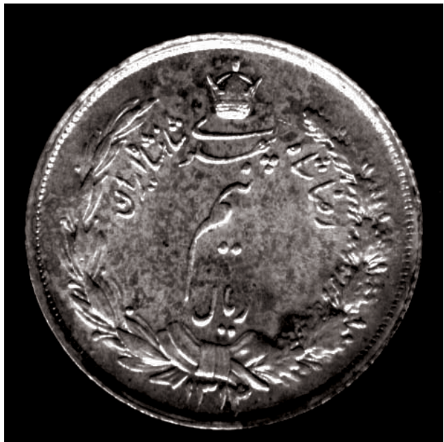
1935 - SH 1314 - 1/2 RIAL - OBV