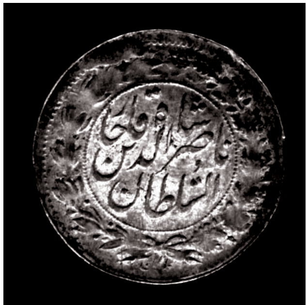
1883 - AH 1301 - 3 SHAHI - OBV