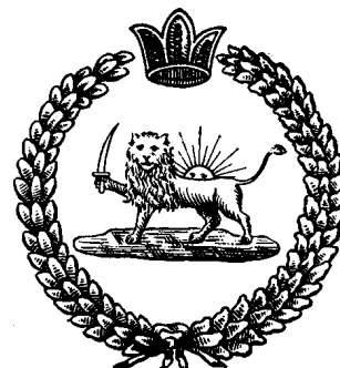
Arms of Persia

TYPE: The Sultan, Mouzaffer-ed-Din Shah no date