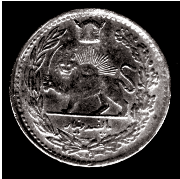
1928 - SH 1307 - 500 DINARS - REV