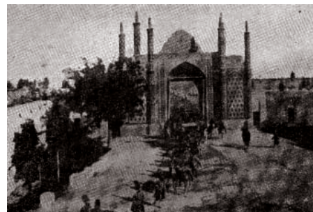
Gate of Tehran