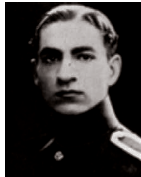
Shahpur Mohammed Riza Pahlavi