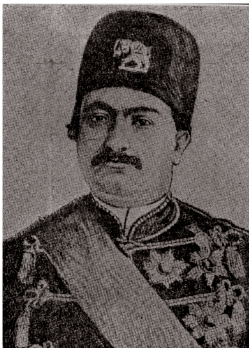
Mohammed Ali Shah