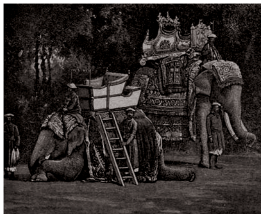
Elephants used for carrying passengers