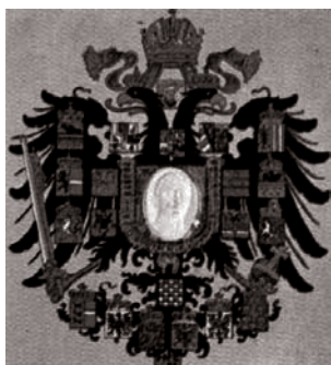
Arms of Austrian Empire

FOOTNOTE: Kormoczbanya (german, Kremnitz), an old mining town, in the country of Bars, in Hungary, 158 miles north of Budapest by rail. It is situated in a deep valley in the Hungarian Ore Mountains region. Among its principal buildings are the castle and the mint where the celebrated Kremnitz gold duckets were struck. The great bulk of the inhabitants find employment in connection with the gold and silver mines, which, though far less productive than formerly, still yield considerable quantities of ore. By means of a tunnel 9 miles in length, constructed in 1851-52, the water is drained off from the mines into the Gran. Population in 1880 - 8,552 mostly Germans. According to tradition, Kormoczbanya was founded in the 8th century by Saxons. Encyclopedia Britannica 9th & 11 Ed. 1888,1911.