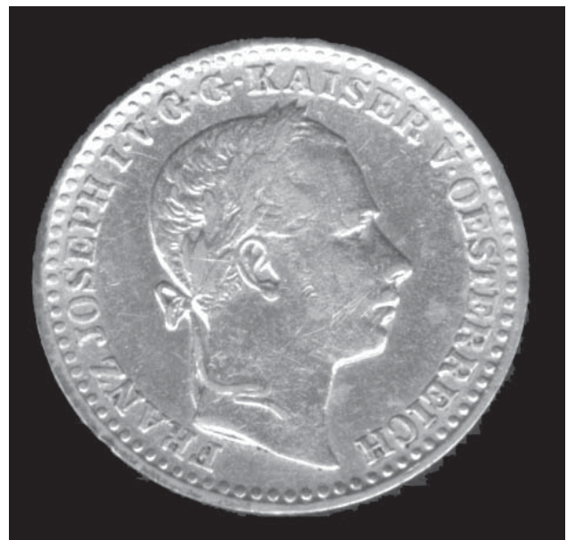
1859 V - 10 KREUZER - OBVERSE