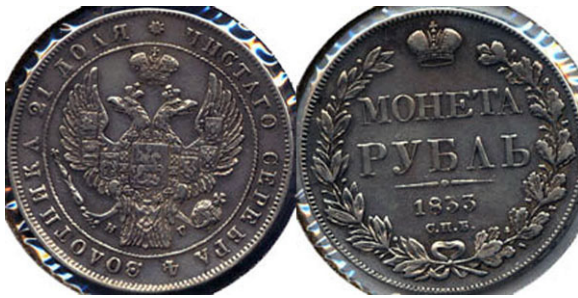
Russian Ruble 1833