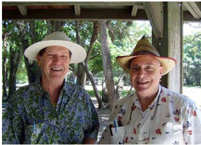
Mutt and Jeff